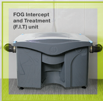
F.I.T UNIT (see separate data sheet for DOSING MODULE)